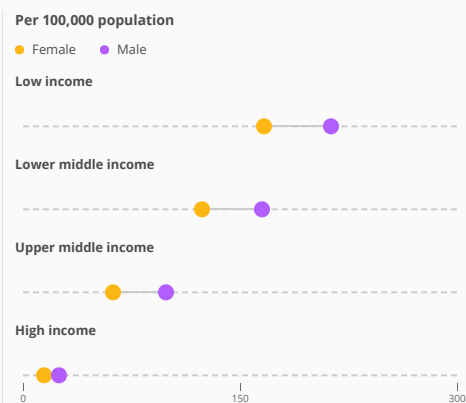
Mortality rate attributed to household and ambient air pollution by sex and income group (age-standardized)